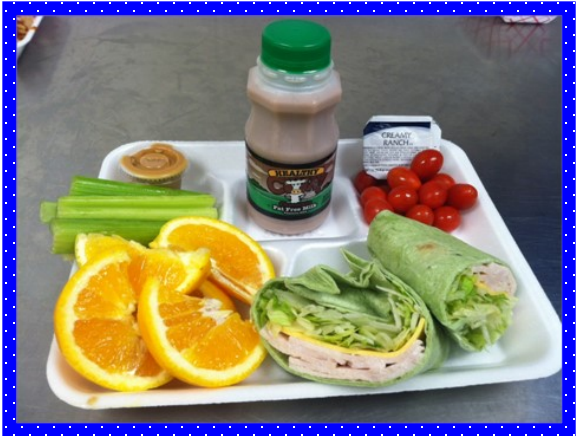
1. Fruit 2. Vegetable 3. Milk 4. Meat 5. Grain