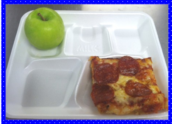
1. Fruit 2. Meat /Meat Substitute 3. Grain