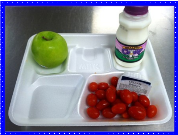
1. Fruit 2. Milk 3. Vegetable

All of these are considered reimbursable meals! All of these meals cost $2.75