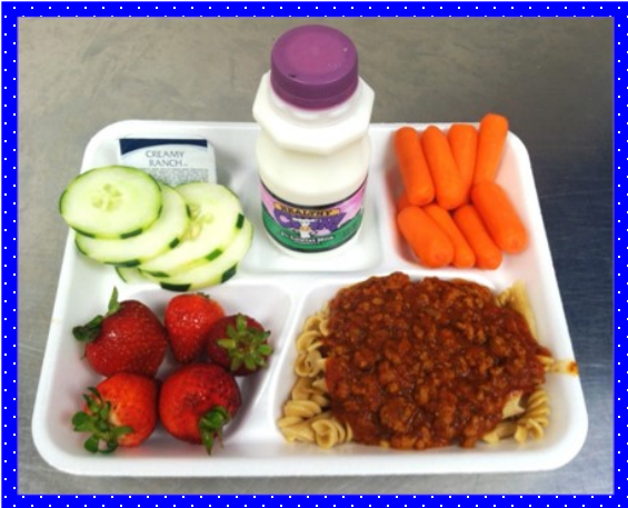
1. Fruit 2. Vegetable 3. Milk 4. Meat 5. Grain